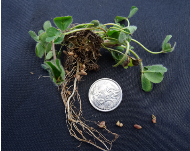
An example of good nodulation, with more than three large pink nodules on this sub-clover plant

Ideally, a sub-clover plant should have at least 20 small pink nodules up to 2mm long (see below – How do I know if sub-clover roots have productive nodules? ). If the nodules are large – greater than 5mm – then three nodules/plant will be sufficient to provide the same level of nitrogen fixation.