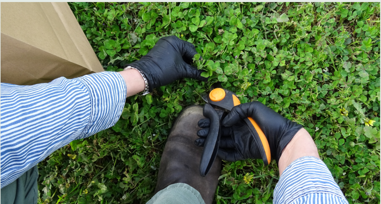
‘Toe cut’ of pasture samples for tissue tests, using gloves and clean cutters

Once collected, sort the sample, carefully removing the sub-clover leaves and their leaf stems (petioles) from other species. Wear plastic gloves to prevent contaminating the sample. Keep the sample cool and send by Express Post to avoid delays.