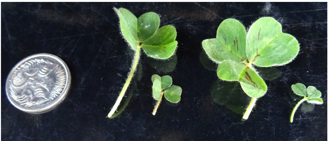
Larger sub-clover leaves taken from plants next to sheep dung, compared to smaller leaves representing plants away from dung

Does your sub-clover have a leaf area smaller than a five cent piece and is the plant bright green with no mottling on the leaves? Is the sub-clover content of your pasture less than 10% in late winter and early spring? If you answered yes to any of these questions you may have an underlying soil constraint affecting sub-clover production.