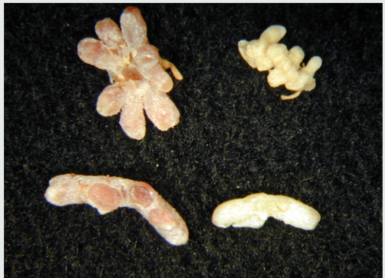
Healthy pink nodules on left side which will fix nitrogen, versus white, ineffective nodules on the right side.

Examining the nodules on sub-clover roots is a useful diagnostic tool. Sub-clover roots should contain pink-coloured nodules. The pink colour signifies the presence of rhizobia bacteria that is fixing nitrogen.