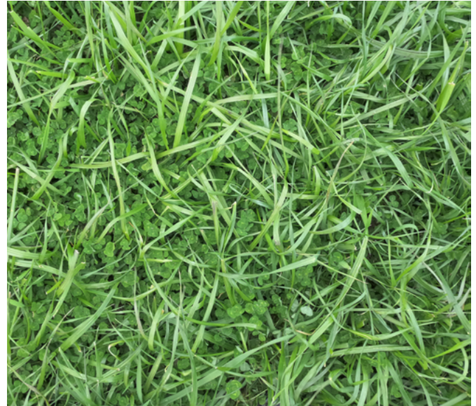
Don't be fooled. The sub-clover content in this pasture was good, but on inspection had no nodules.

It is not uncommon to examine sub-clover plants and find no nodules, yet the plant appears healthy and growing well. These plants are not fixing nitrogen, but instead are using soil nitrogen just like the grasses.