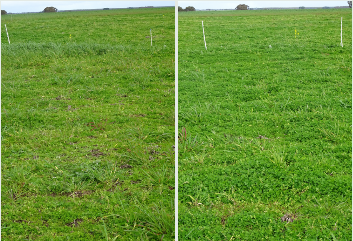
Phosphorus versus phosphorus plus molybdenum fertiliser strips indicate a response to molybdenum

Fertiliser or lime test strips are a fantastic visual indicator of the culprit/s having the greatest impact on growth. It could be that all three (P, S, K) are limiting, which is why all nutrients are applied to one strip and then each is omitted from a strip to see which has the biggest influence on plant response. 7