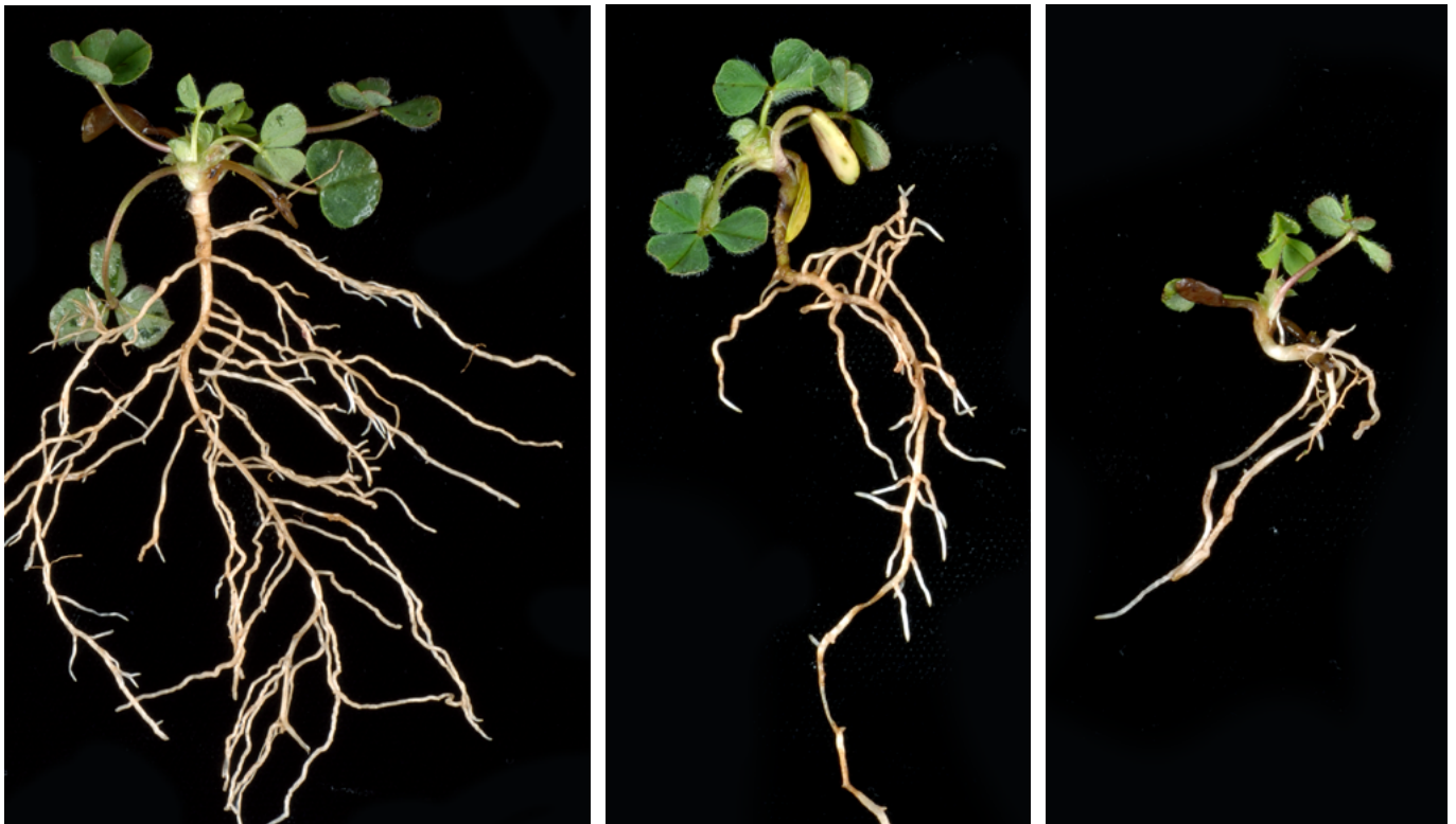
Healthy white and much-branched sub-clover plant roots (left) and reduced root branches, pruned tap roots and presence of brown lesions (middle and right).

More information on diagnosis of poor sub-clover can be found in the MLA fact sheet: How do I determine why my sub-clover is underperforming?