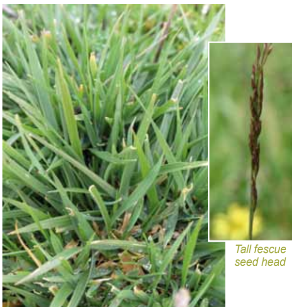
Vegetative summer-active tall fescue