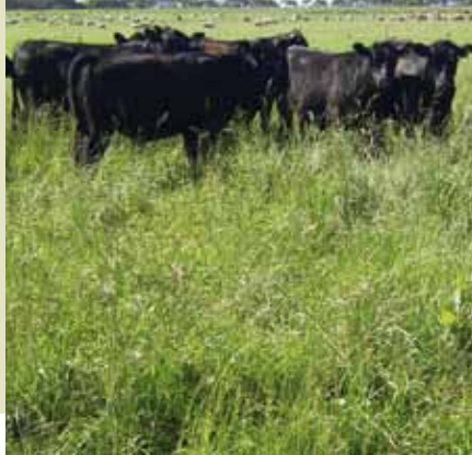
Tall fescue out of control in spring 2007 – Hamilton Proof Site

leaves or approximately 1500–2000 kg DM/ha. It can be grazed down to approximately 1000 kg DM/ha as long as it is rested afterwards.