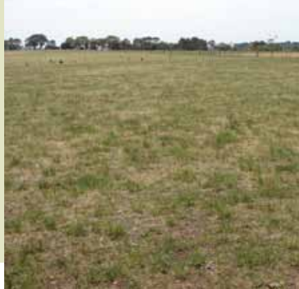
Summer-active tall fescue in November 2006 (drought year)

Summer-active tall fescue is palatable and of high nutritive value provided it is kept short with frequent grazing in spring. It is very compatible with subterranean clover and allows a high legume content.