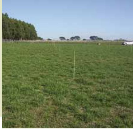
Rotationally grazed summer-active tall fescue in May 2007

Direct drilling is preferred but sowing into a cultivated seed bed is also effective for improving seed-soil contact. Sowing should be no deeper than 12 mm. Broadcasting the seed on the soil surface is not recommended.