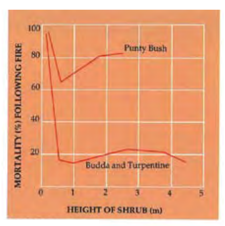
Figure 3. Mortality of shrubs by height, after burning.