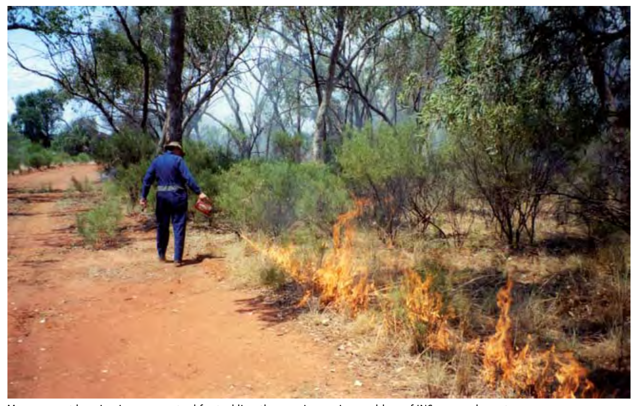
Management burning is a proven tool for tackling the ever increasing problem of INS encroachment.

Dense stands of INS also reduce habitat diversity. INS favours certain fauna species such as insectivorous birds, but the decline of grass-timber mosaics affects a range of other birds and wildlife. Established INS can also lead to the decline of perennial groundcover and soil erosion. Uncontrolled grazing pressure from feral, native and domestic animals worsens these effects by reducing pasture vigour.