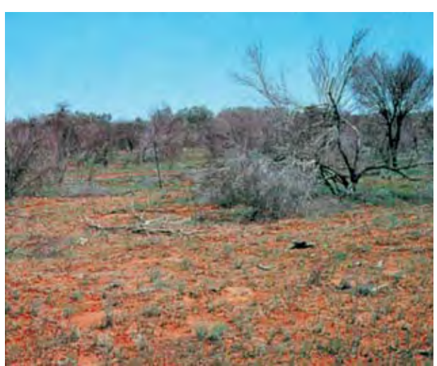
Figure 1c. Several months later the bushes are dead (91 per cent of the hopbush was killed) and the paddock is regenerating after the burn.

Management of existing INS and new seedlings is a major priority for landholders in western New South Wales. This fact sheet examines the principles of management burning as a proven tool for tackling the ever increasing problem of INS encroachment.