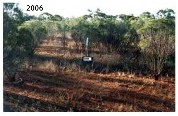
Figure 4. This area experienced a wildfire in the summer of 1984. By 1990 there was ample fuel for a second burn. If a second burn had taken place this regrowth and germination would have been eliminated. However, encroachment continued and the area is now dominated by woody vegetation.