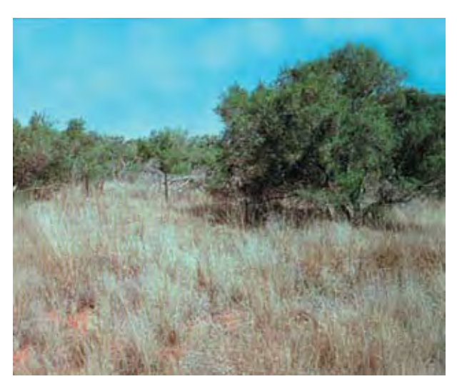
Figure 1a. Before the management burn. Note the good cover of grass fuel.